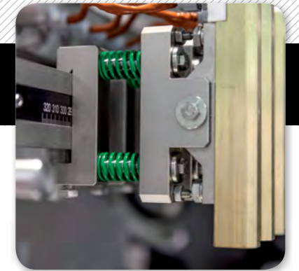
3. Easy format changing.