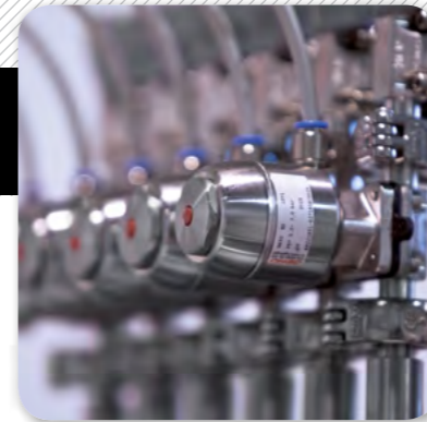
1. Shut-off nozzles.

Overall Equipment Efficiency (OEE) > 95%