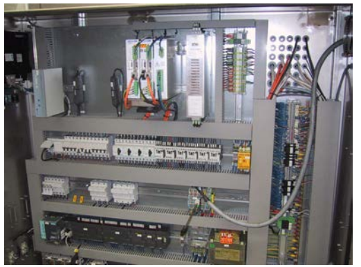
Vetta control box