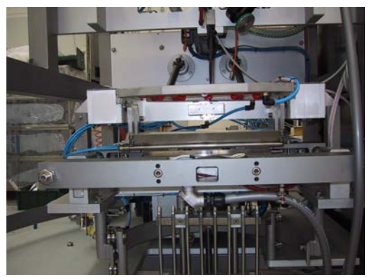
Dies in standard position