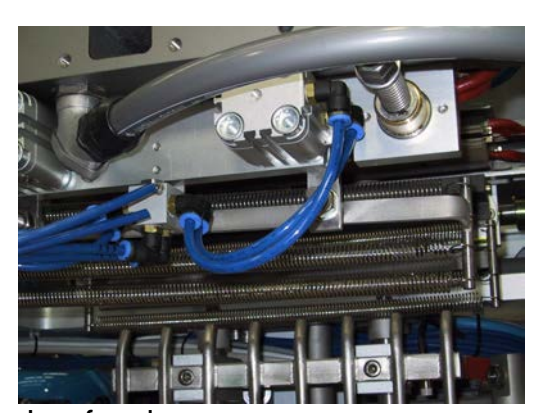
Jaw for zipper