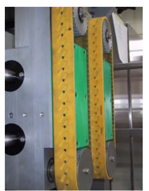
Vacuum pull belts