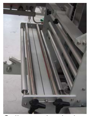
Splice assist device