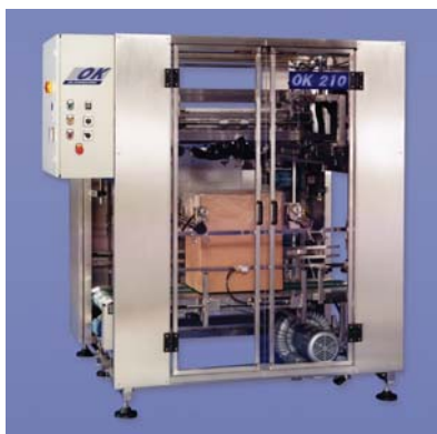
The flexible OK-210 case liner