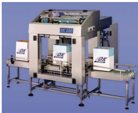
The heavy duty OK-200 case liner

OK-200 A heavy duty machine designed for demanding applications. The machine is equipped with a 250mm height adjustable conveyor with case in-feed and discharge sections. OK-222 The oversized version of the OK-220 machine. OK-210 A versatile machine, suitable for applications requiring large flexibility, including the lining of drums and pails. This machine has a fixed conveyor and an internal 600mm height adjustable frame.